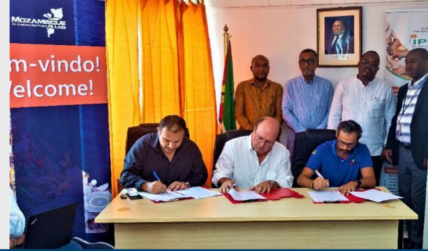
Certification Support Program sponsored by Mozambique LNG, September 2019